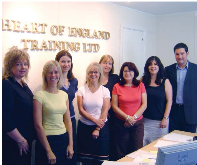
Heart of England Management Team

The staff - 'they are friendly and supportive' 'I can phone my hairdressing trainer at any time, as long it's not during Coronation Street'